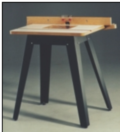
Part No. 420-100