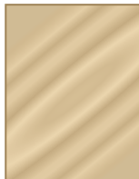
1/16" rabet use #67410 collar