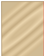
Flush rabet use #67408 collar