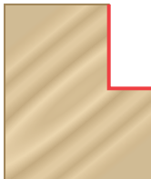
1/4" rabet use #67420 collar