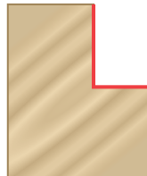
11/32" rabet use #67424 collar