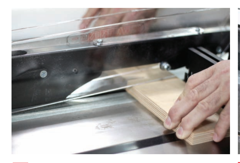
5 Keep your hands out of path of the saw blade.