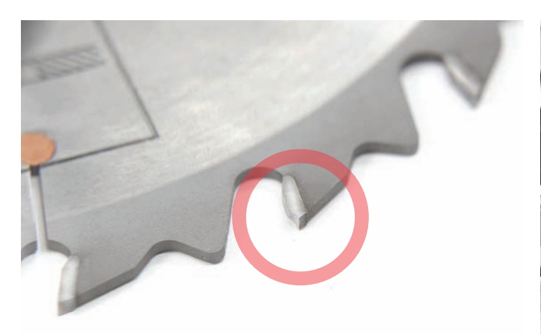
Do not use a blade that is cracked or broken, has a chipped or missing tooth, or has been dropped or damaged.