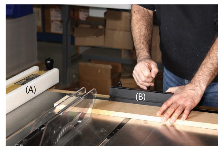
Never use fence(A) and the guide(B) at the same time. Do not force the blade into the cut. Use a feed rate that does not bog down the saw.