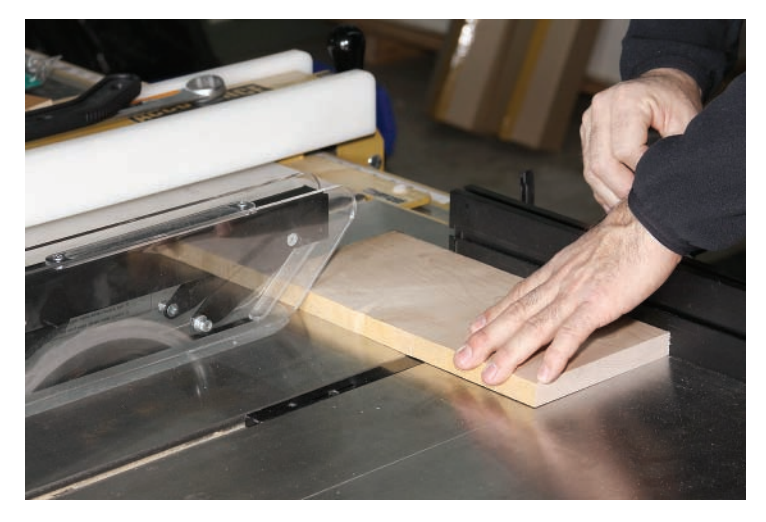
Allow saw to reach maximum RPM before starting the cut.