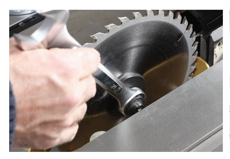
Make certain that the arbor nut is secure before starting the saw.