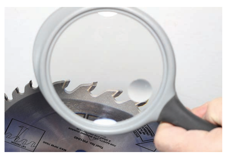
Have your saw blade professionally sharpened and inspected.