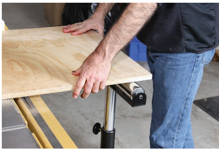
20 Use roller stands to support the large workpiece.