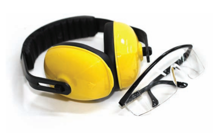
Always wear eye and ear protection during operation of power tools.