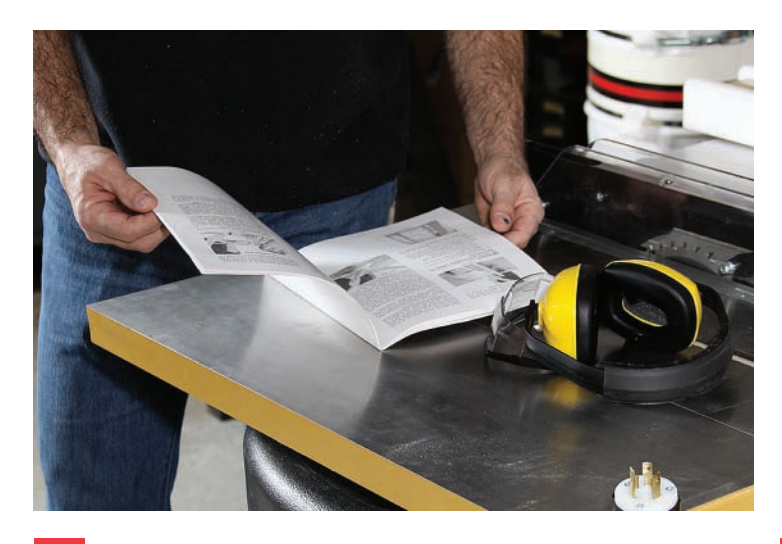
1 Always refer to your power tool owner's manual.