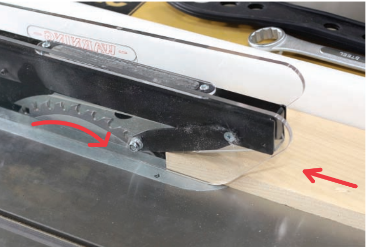
Always feed the stock against the direction of the power tool rotation.