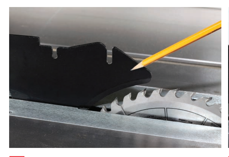
13 Use a splitter or riving knife to prevent kickback.