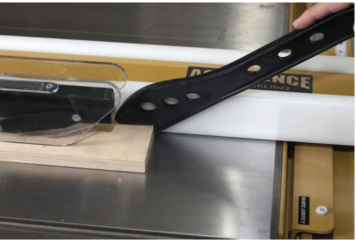
Use a push stick to distance your hands from the blade when ripping narrow stock.