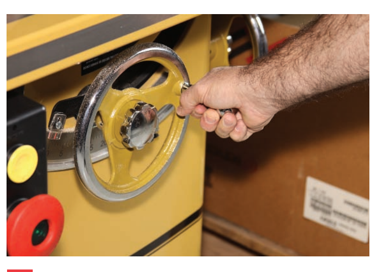
Never make adjustments to the saw while the blade is spinning.