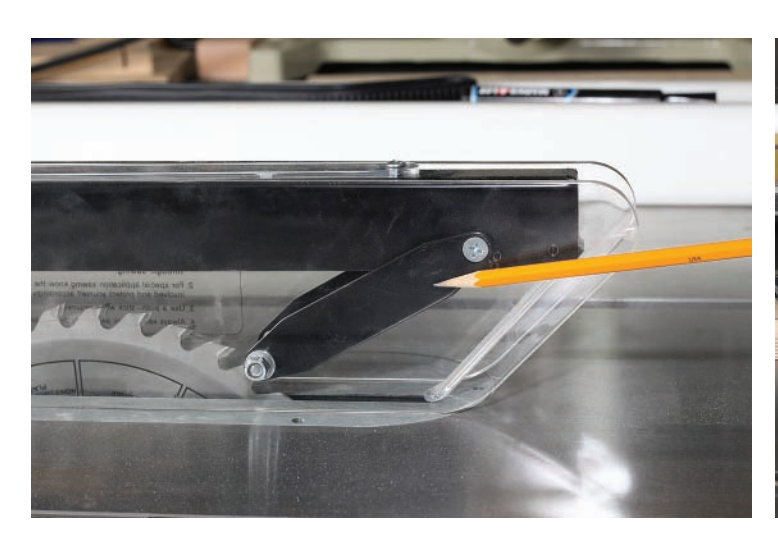
15 Always use the guard that came with the saw.