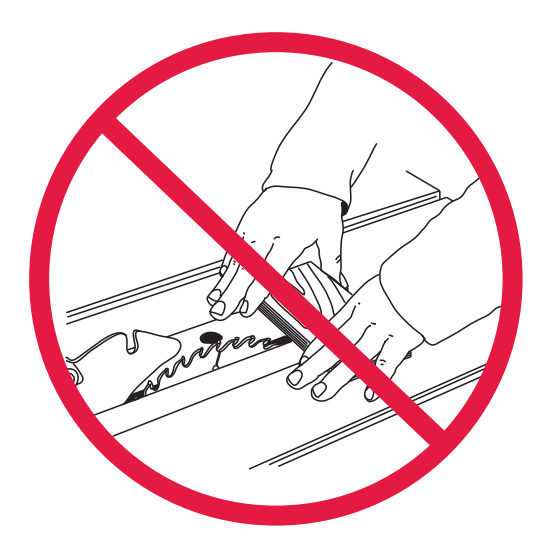
Never cut stock freehand. Always use the fence or miter gauge to support the workpiece.