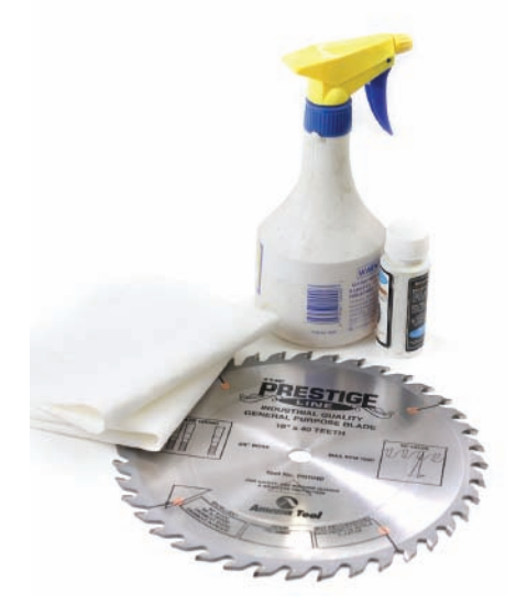
22 Keep the saw blade sharp and clean.