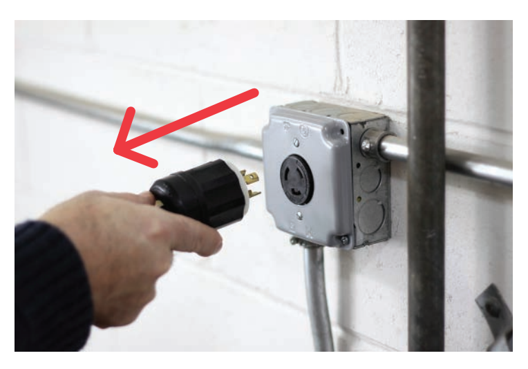
Disconnect the power tool from the power source before changing the saw blade.