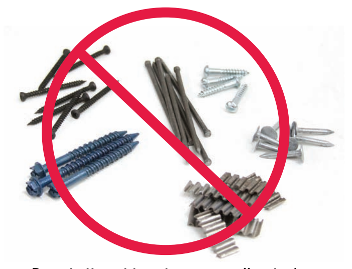
Do not attempt to cut screws, nails, staples, concrete or other foreign materials. Use saw blade only for which it was intended.