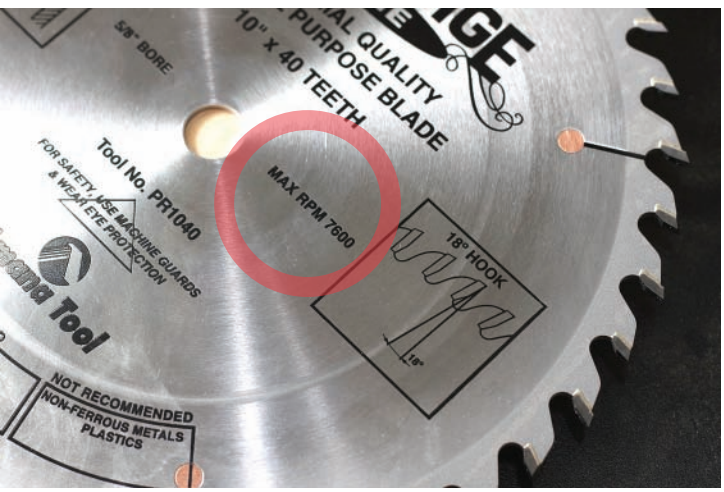
Never exceed maximum RPM of the saw blade. Each blade may differ, please see blade stencil.