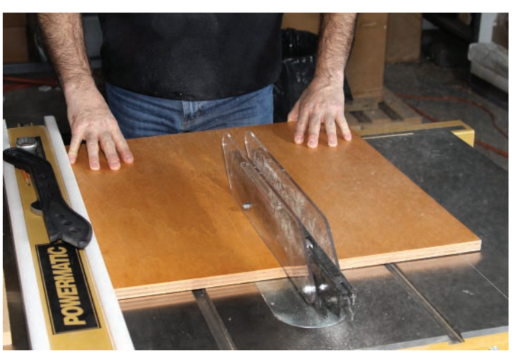
Make certain the workpiece is supported before starting the saw.