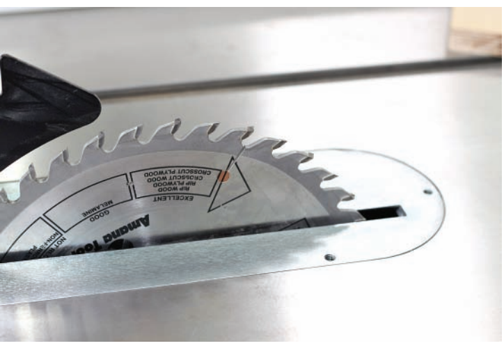
When mounting the saw blade, saw teeth must face the direction of power tool rotation.