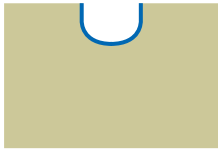
Core Box 4 Sizes Available