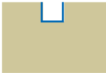
Straight 4 Sizes Available